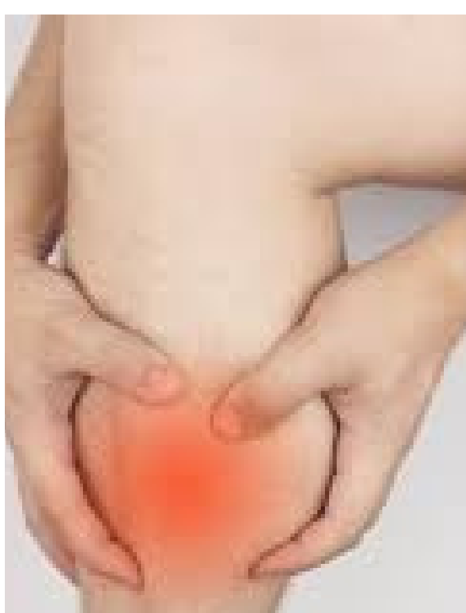
Restless Leg Syndrome